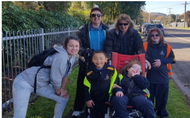
On the way home