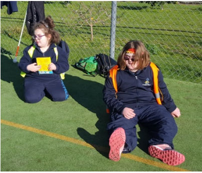
Having a rest after bowls

Today a group of our students went to visit the Wheako Unit at Lytton High; we were warmly invited by the staff and especially the students. Our students and staff combined to enjoy a game of bowls and were able to socialize with song, prayer and some morning tea.