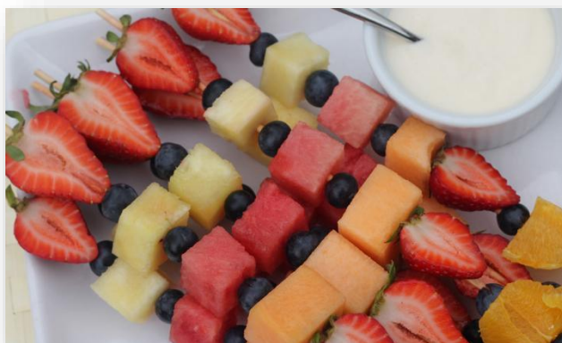
The Story of Joseph Supper afterwards - Bring a Plate

Fri 27 th September Mufti-Day School finishes at the normal time.